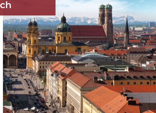
Layout & design: einfallswinkel PartG